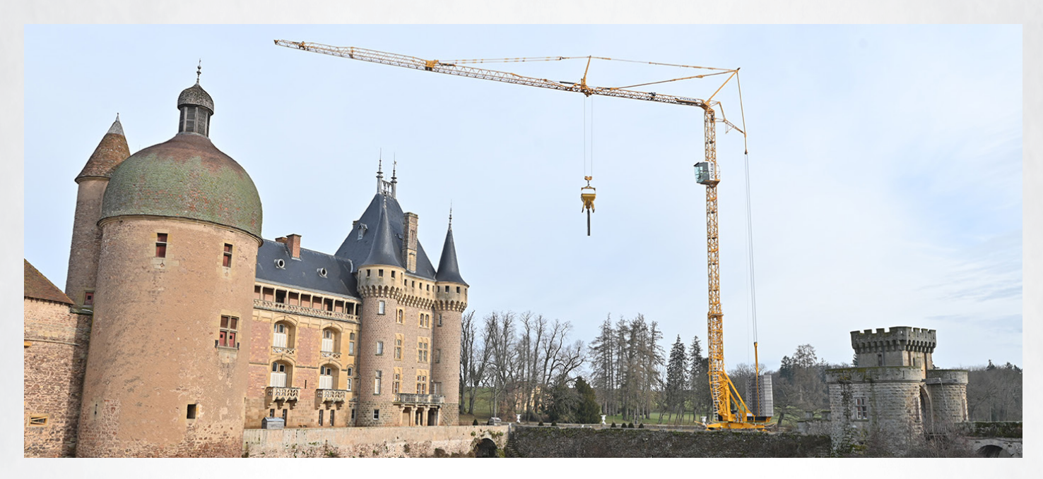
Potain's most powerful Igo T. Perfectly suited to residential and bridge construction.