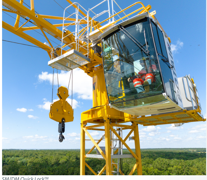
SM/DM Quick Lock™