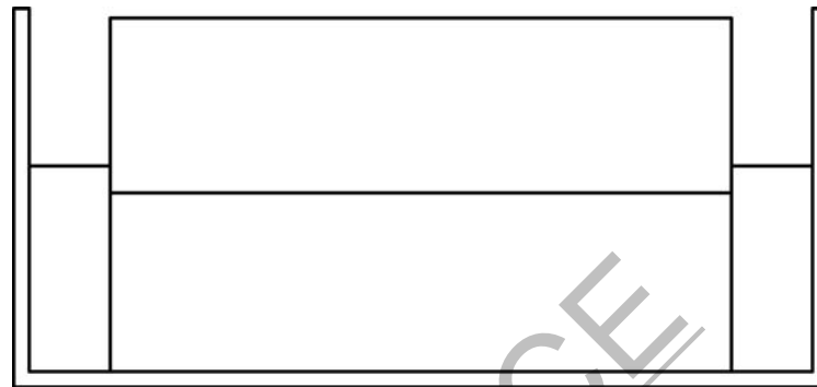
16000 WA Auxiliary Counterweight

41,300 lb (18 730 kg) Auxiliary Counterweight (2 rear boxes)