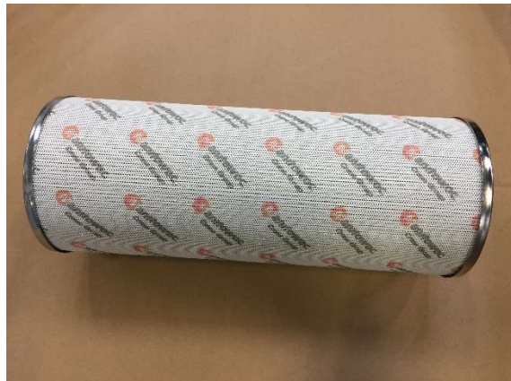
1x 04286260 Air Dryer filter with oil coalescer