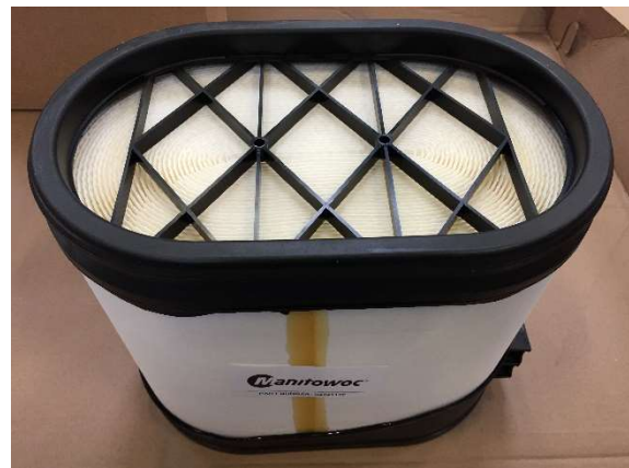
1x 04241158 Engine back-up air filter